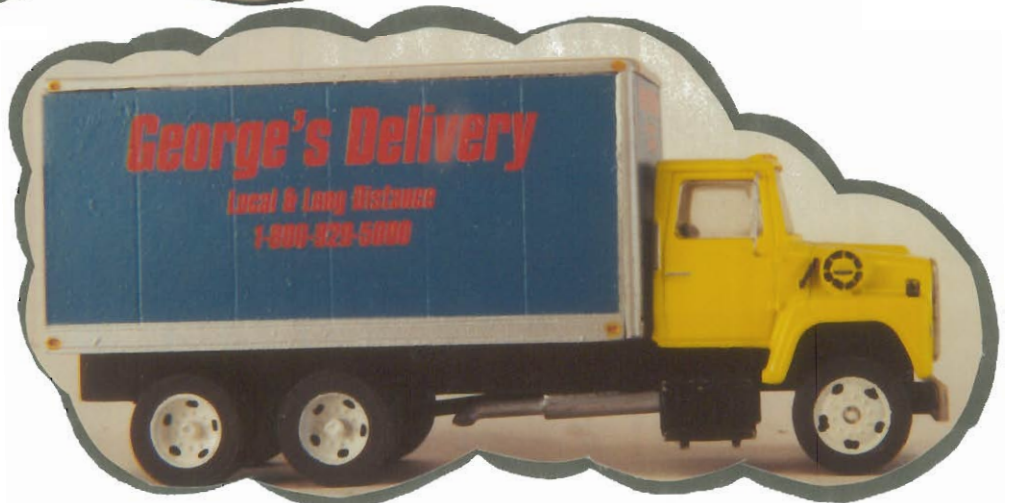
#5103.....GEORGE'S DELIVERY DECAL SET. TRUCK NOT INCLUDED