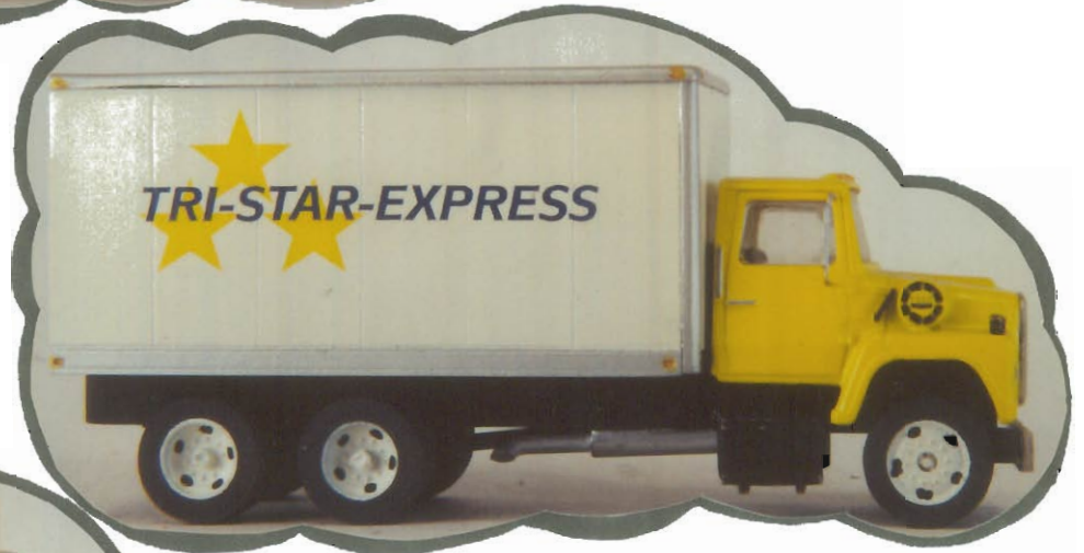
#5101.....TRI-STAR EXPRESS DECAL SET. TRUCK NOT INCLUDED