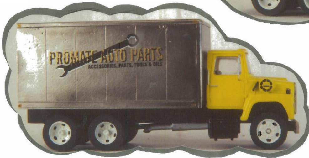
#5106.....PROMATE AUTO PARTS DECAL SET TRUCK NOT INCLUDED