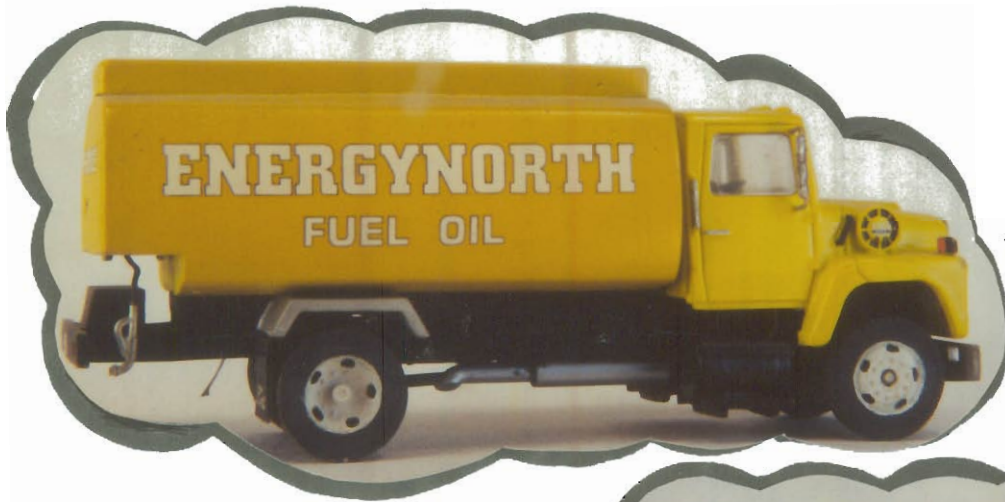
#5100.....ENERGYNORTH FUEL OIL DECAL SET. TRUCK NOT INCLUDED