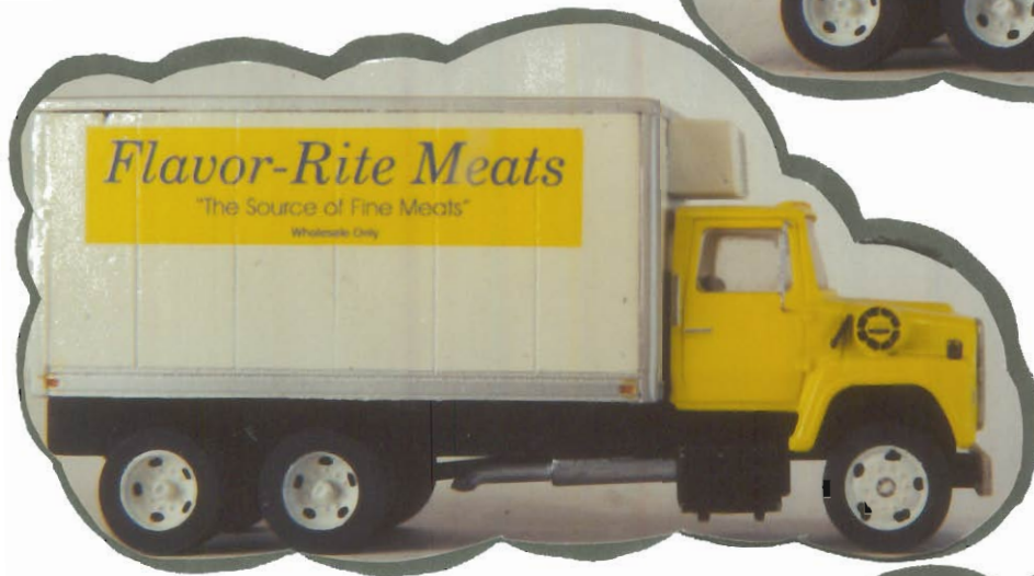
#5102.....FLAVOR RITE MEATS DECAL SET TRUCK NOT INCLUDED