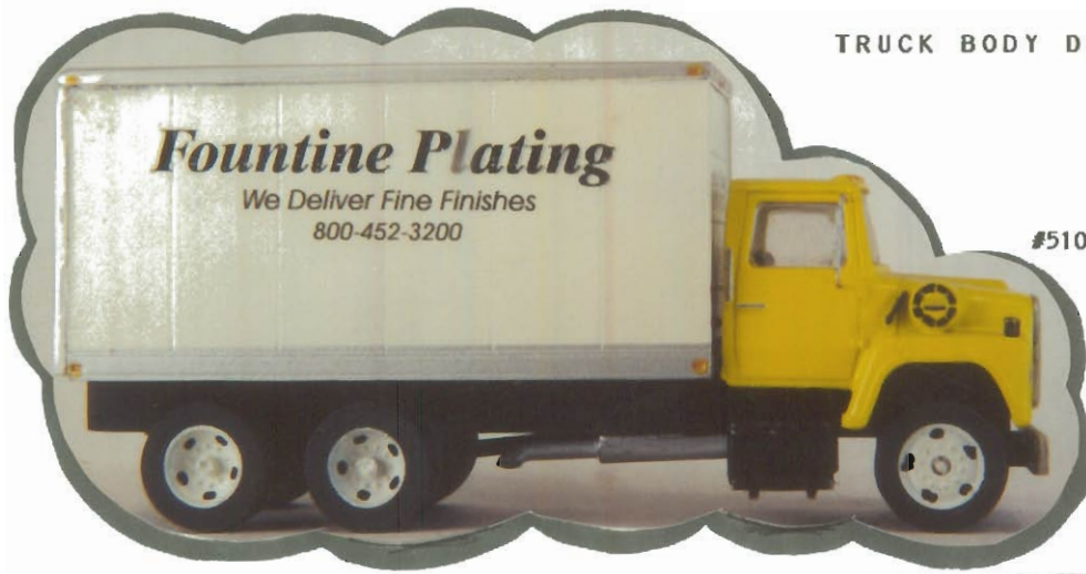
#5104.....FOUNTINE PLATING DECAL SET TRUCK NOT INCLUDED