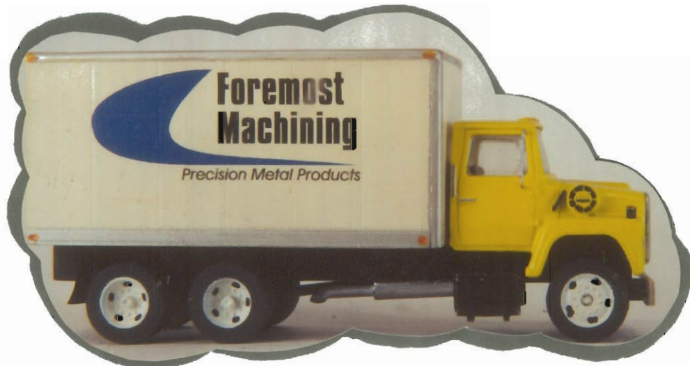
#5107.....FOREMOST MACHINING DECAL SET TRUCK NOT INCLUDED