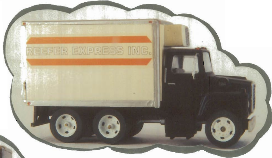
#5105.....REEFER EXPRESS INC. DECAL SET. TRUCK NOT INCLUDED